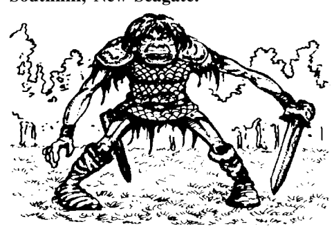
"Just try and collect it!"

Adventurers wishing to go hunting any of these or collecting any bounty ingredients must see Master Gosfred at the Seagate Alchemist Guild (Restored), Southhill, New Seagate.