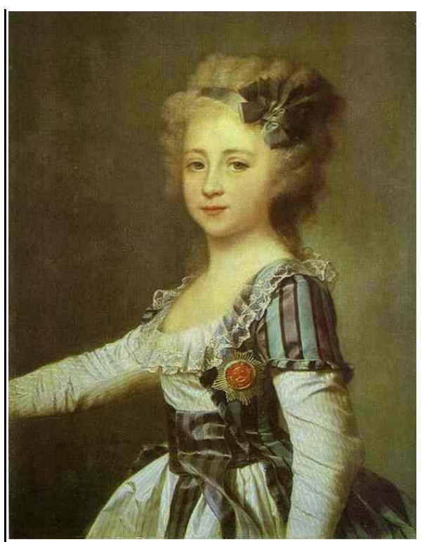
Princess Meredithis of Ranke